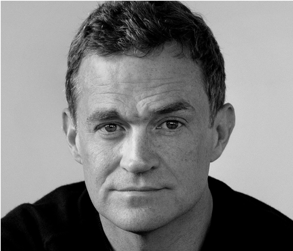
Patrick Radden Keefe