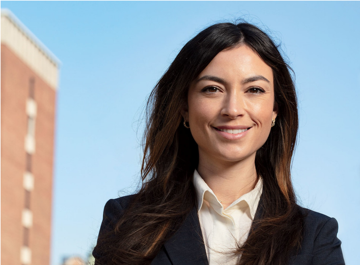
Reed Kessler