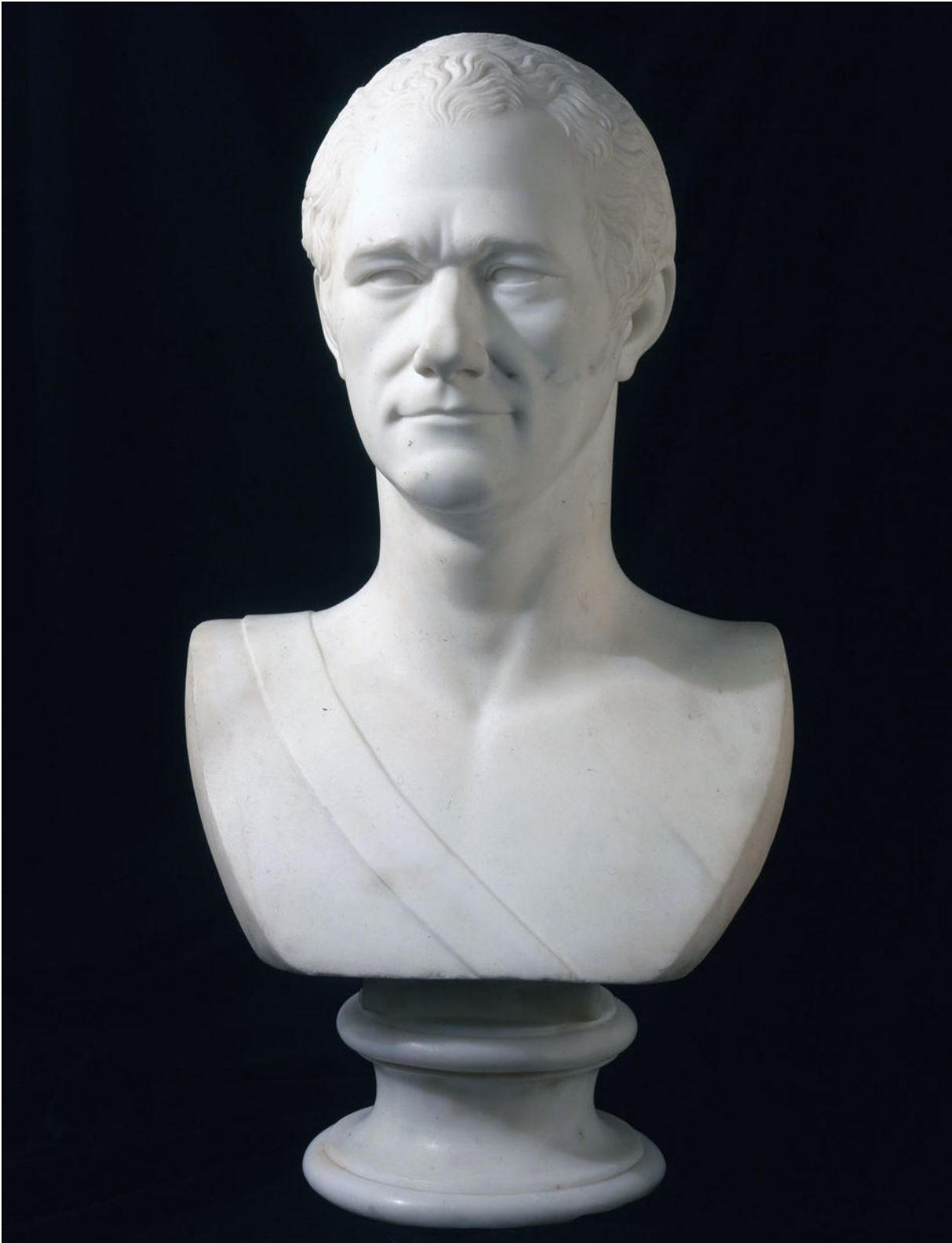
"Alexander Hamilton" by Giuseppe Ceracchi, circa 1793.