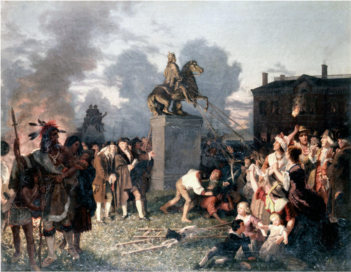
"Pulling Down the Statue of King George III, New York City," by Johannes A. S. Oertel, 1852-1853.

One of the most engaging aspects of the Smith Gallery is History Under Your Feet , a tribute to urban archaeology. Displayed below the floor, in nine manhole-like exhibition cases, are such artifacts as the shoes of a child killed in a 1904 fire aboard a steamboat called the General Slocum (the deadliest catastrophe in New York before 9/11) and a crushed clock, stopped at 9:04 a.m., recovered from the World Trade Center debris.