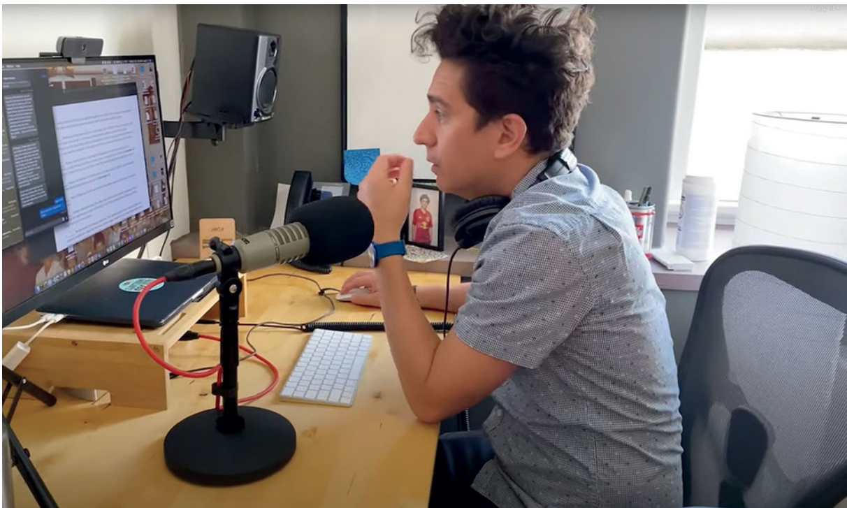
John D. and Catherine T. MacArthur Foundation