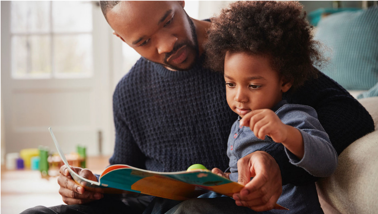
Miles to Row