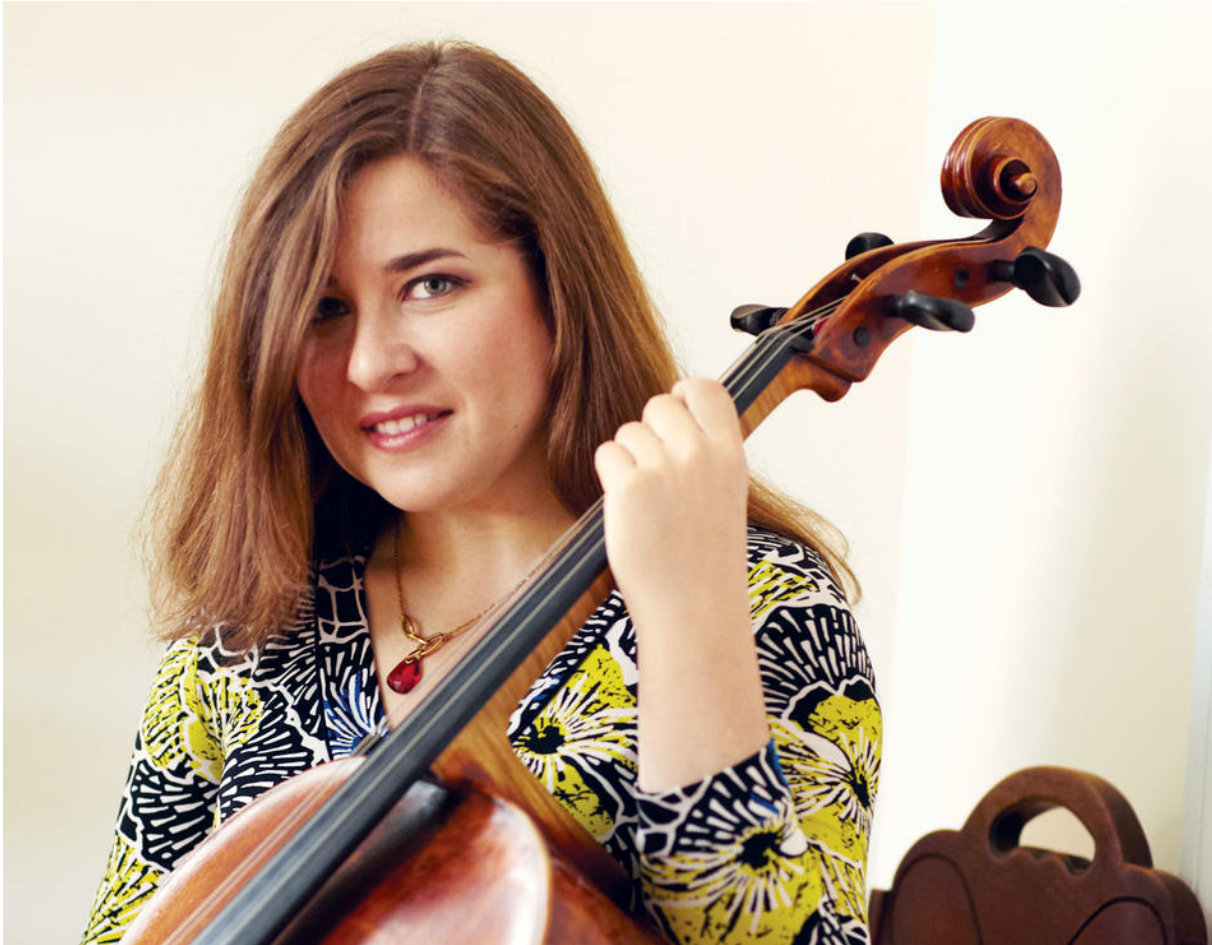
Alisa Weilerstein