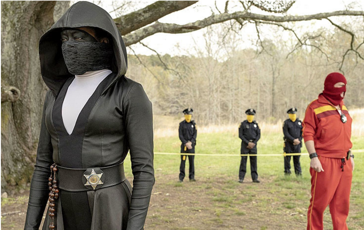
Regina King in "Watchmen." (HBO)

Watchmen was a direct response to the 2016 election and the Black Lives Matter movement.