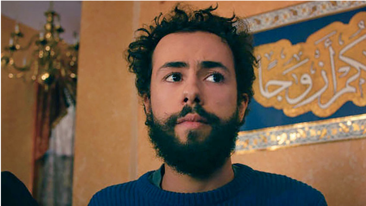
Ramy Youssef in "Ramy."

As a filmmaker, Dabis is on a mission to shift perceptions and undermine dangerous stereotypes. She has written and directed two feature films, Amreeka and May in the Summer , both of which portray Arabs in everyday, relatable scenarios. (Dabis herself starred in the latter movie.) She has also built an impressive career in TV and recently served as a director and co-executive producer on Ramy , a comedy about a young Egyptian-Muslim man grappling with religious piety and sexual freedom in contemporary New Jersey.