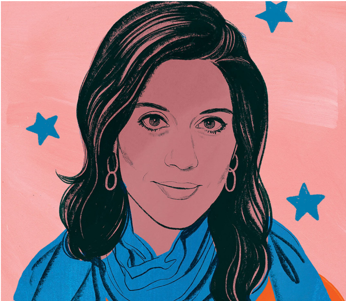
Cherien Dabis