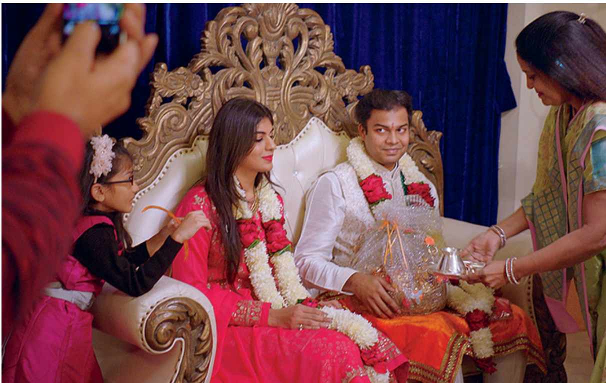
"Indian Matchmaking" (Netflix)