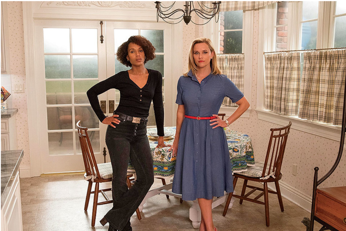
Kerry Washington and Reese Witherspoon in "Little Fires Everywhere."