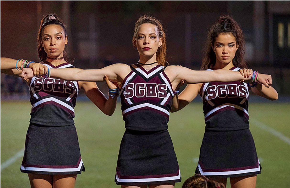
"Dare Me" (Netflix)