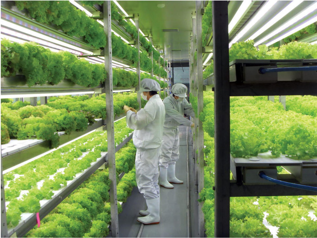
Scientists at a vertical farm in Suwon, South Korea, work in a hermetically sealed, clean-room environment.

“I think there are more realistic things we could be doing to make land-based agriculture more sustainable,” Bugbee says. “For instance, we could invest more public funds into genetic-modification research, in order to develop crops that require fewer pesticides and herbicides. Frankly, I find the whole vertical-farm concept to be a distraction.”