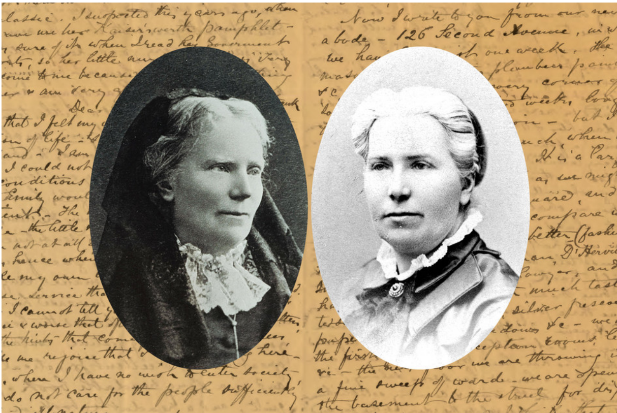
Elizabeth Blackwell and Emily Blackwell.