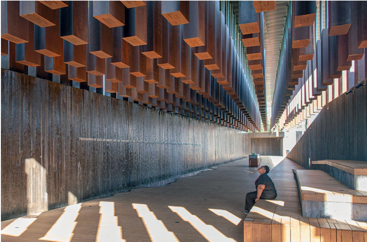
National Memorial for Peace and Justice, Montgomery, Alabama.

immortalized — in the form of a six-foot-tall bronze statue outside of Sioux City, Iowa, the site of the crash.