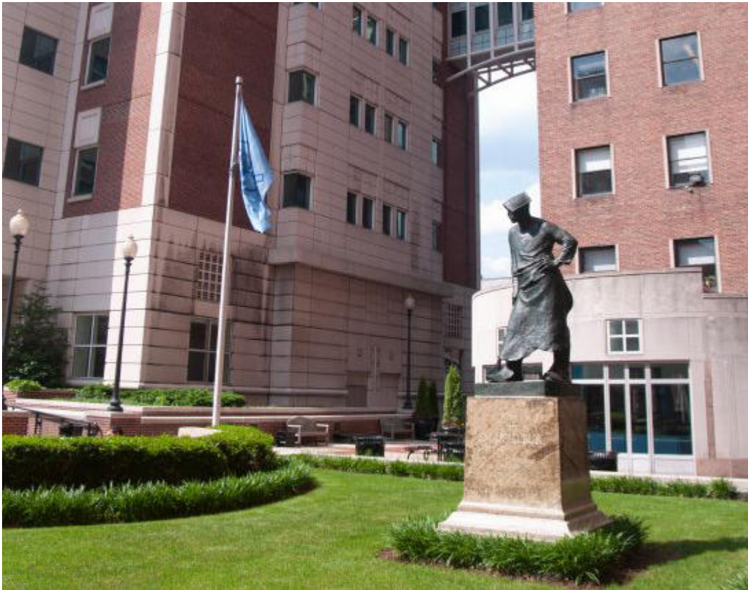
Sculpture by Constantin Meunier.