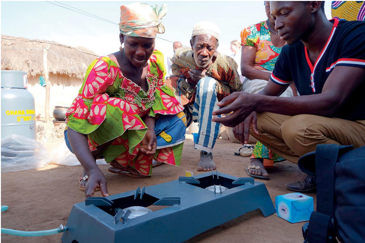
Ghanaians install a low-emissions stove.