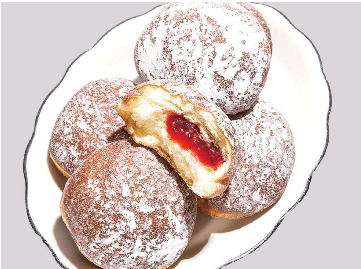
Noah Fecks [photo], from "The 100 Most Jewish Foods," by Alana Newhouse (Artisan Books), 2019.