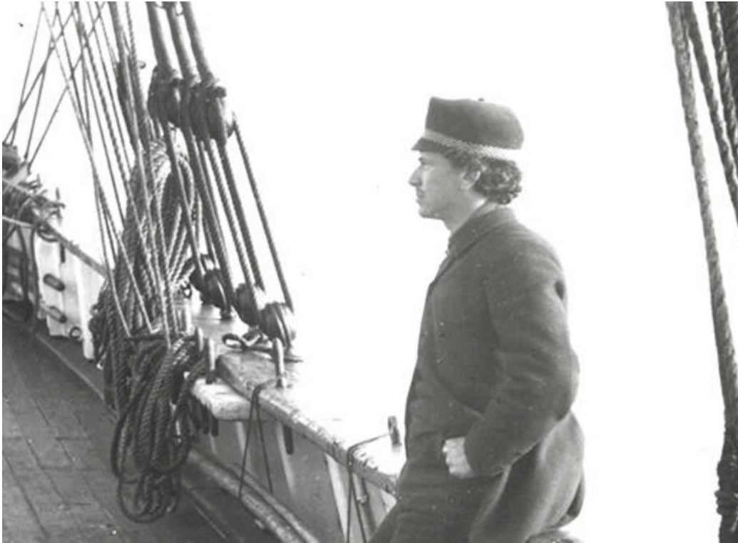
The American Philosophical Society

Boas sailed to Baffin Island in 1883. He had become fascinated by the Inuits' capacity to move across vast distances, survive in a difficult environment, and make sense of a landscape that could appear, to outsiders, bleak and formless.