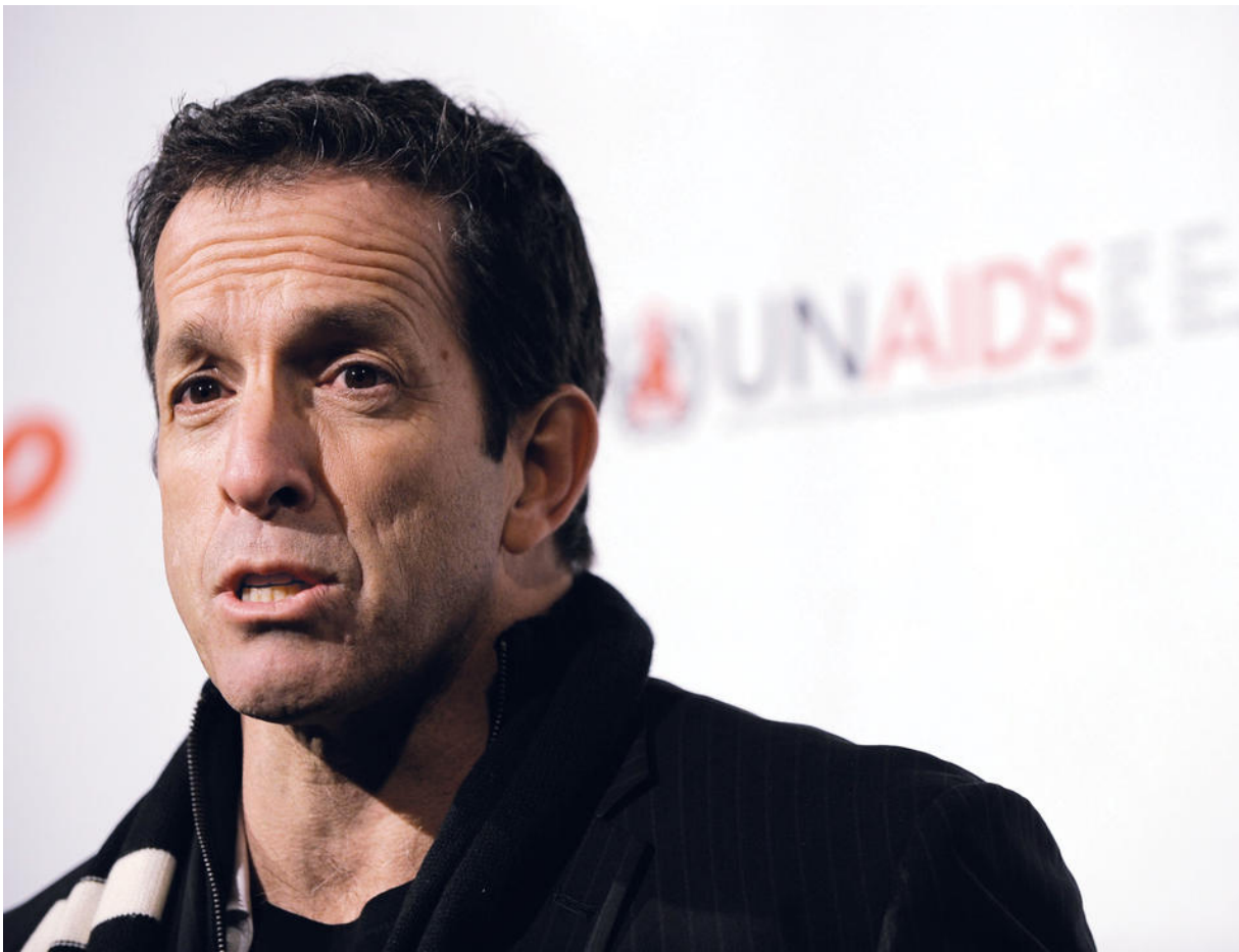
Kenneth Cole

Fashion designer Kenneth Cole has joined with Columbia College and the Fu Foundation School of Engineering and Applied Sciences to launch a new fellowship program that will prepare students to solve challenges faced by local communities. The new Kenneth Cole Community Engagement Program, which is supported