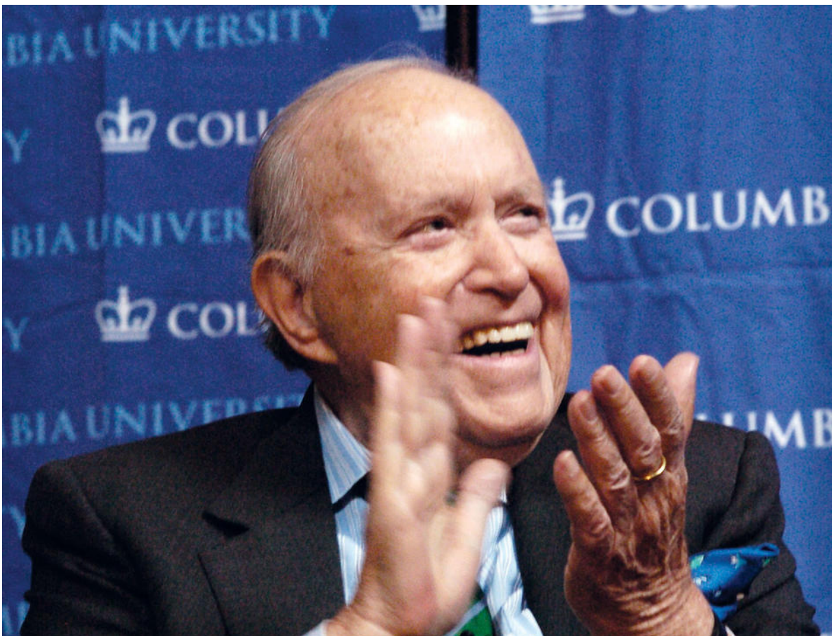
John W. Kluge

John W. Kluge '37CC, '88HON, an extraordinary businessman and Columbia University's greatest benefactor, died on September 7 at his home outside Charlottesville, Va. He was 95.