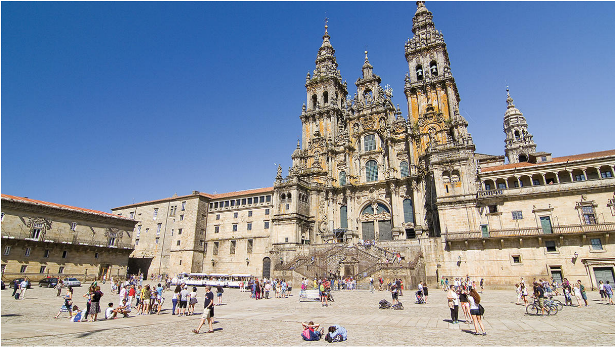
The Cathedral of Santiago de Compostela, home of the shrine of St. James.