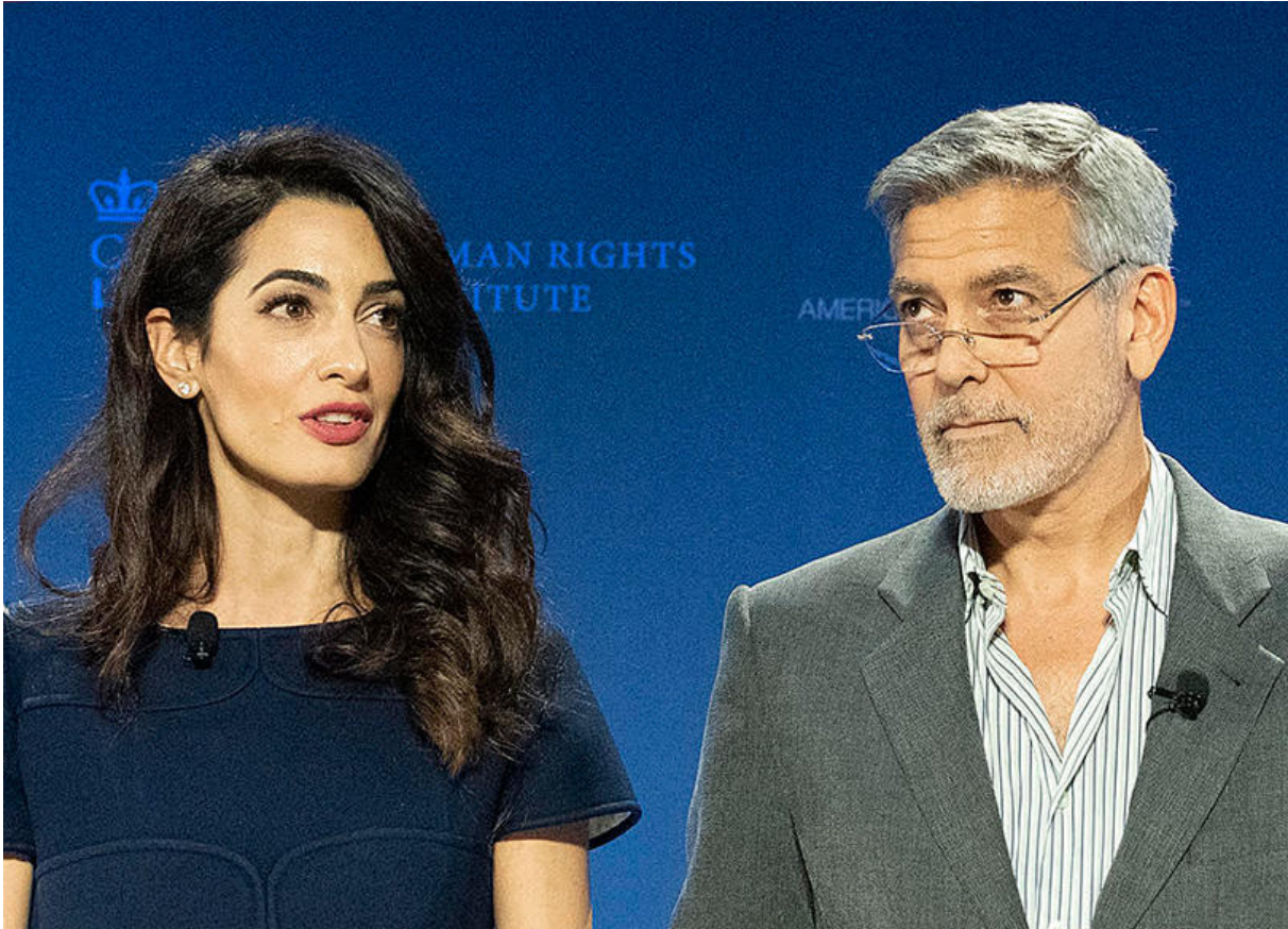
Amal and George Clooney at Columbia Law School.

The law school's Human Rights Institute and the Clooney Foundation for Justice have joined forces to train Columbia law students to monitor legal proceedings against journalists, dissidents, LGBTQ people, women and girls, members of religious minorities, and other vulnerable groups in countries where human rights are at risk.