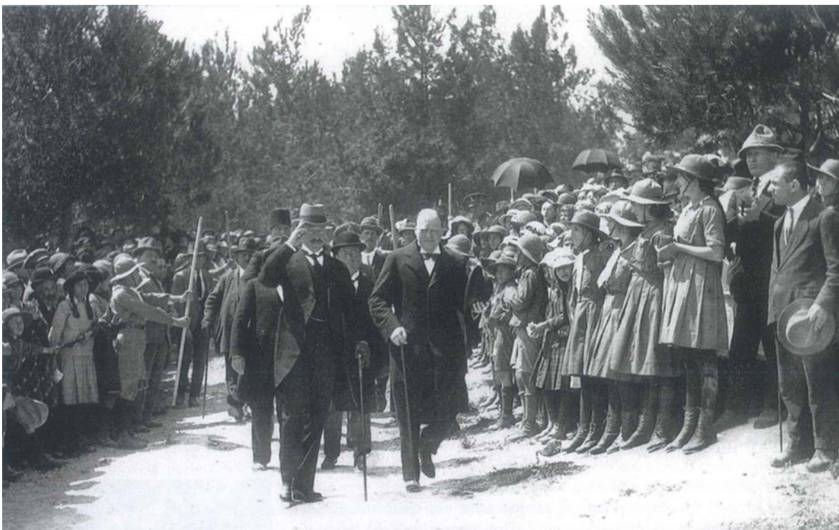
Winston Churchill and Herbert Samuel, high commissioner of Palestine, walking toward the site of Hebrew University in Jerusalem, March 1921.

Winston Churchill is not usually regarded as one of the leading British statesmen responsible for Britain's backing of the Zionist movement and the resurrection of the Jewish national home. The names of Foreign Secretary Arthur Balfour, who authored the Balfour Declaration, or his prime minister, David Lloyd George, more readily come to mind. Indeed, Churchill, who in the early 1920s became colonial secretary,