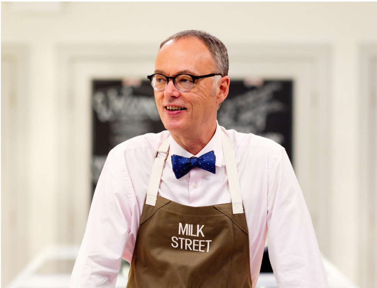
Christopher Kimball

In his new cookbook, Milk Street: Tuesday Nights , Christopher Kimball '73CC — chef, television host, and bow-tie enthusiast — relies on global flavors to keep cooking simple and interesting. We asked him to share a recipe and his philosophy on weeknight meals.