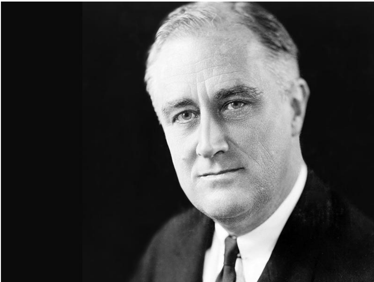
Franklin Delano Roosevelt in 1933.