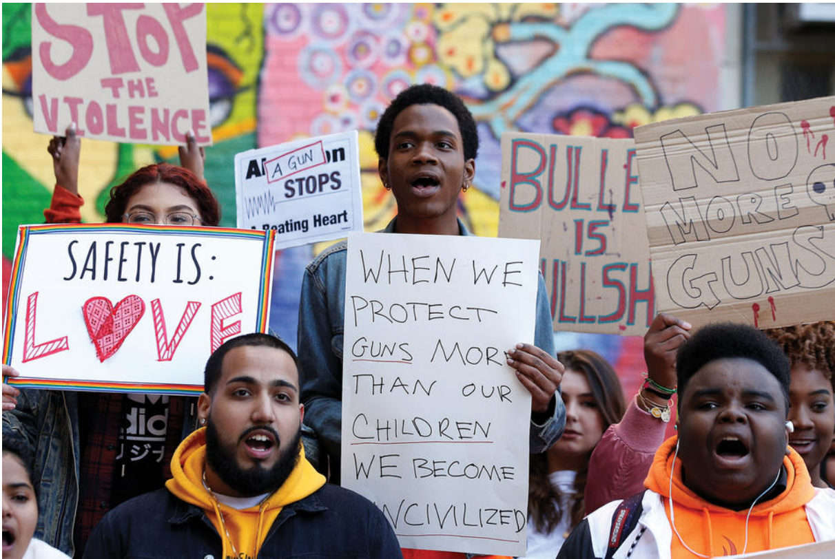
New York City students take part in a national school walkout to protest gun violence on April 20, 2018

● On my way to work, I pass a charter school that boasts “world-class progressive education for the children of Harlem.” While violent crime has dropped significantly in New York City over the last two decades — I’ve heard gunshots maybe half a dozen times in the eighteen years I’ve lived in Harlem — when it does occur, these kids are among the most likely to be exposed to it. They may not encounter as many firearms as their peers in, say, a gun-friendly south Florida suburb, where some families spend Sundays at the range, but it’s a good bet that they see more gun crime.