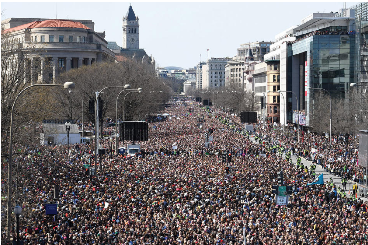
People attend the March for Our Lives demonstration for stricter gun control in Washington, DC

● From the perspective of someone who devotes all her time and energy to America's gun-violence problem, the Parkland students have had a major impact. Though they were called "crisis actors" by trolls, their social-media savvy pushed them above the din and nudged the National Rifle Association closer to the fringes. Gun-rights advocates have defined the debate for decades, claiming the moral high ground in their defense of the constitutional right to bear arms. But in the wake of Parkland, the NRA has lost dozens of corporate partners, been cited multiple times for violating campaign-finance laws, and suffered a sharp decline in membership.