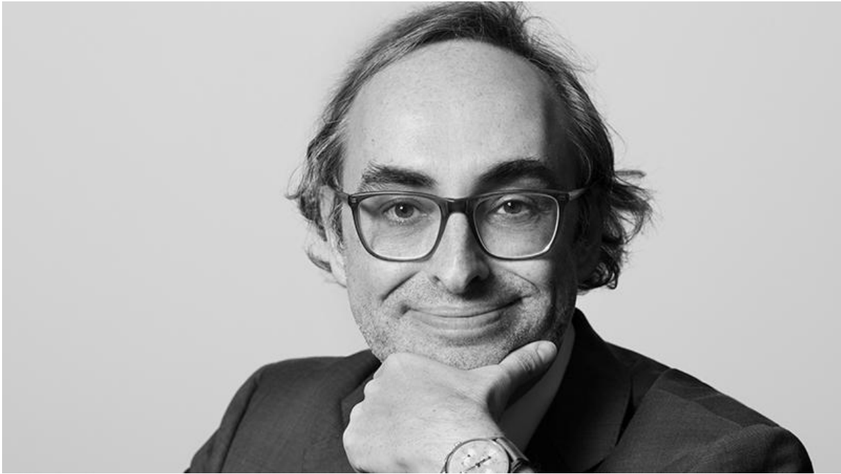
Gary Shteyngart

Along the way, he scores crack in Baltimore, suffers a breakdown in Phoenix, and has a cringingly awkward stay with Layla's parents in Richmond. He finally finds Layla in El Paso, and as he falls into an effortless intimacy with his former love and her son, there's enough space in the narrative for us to ask painful questions about what's stopping him from having the same kind of relationship with his own wife and child back home. Barry is so divorced from reality that he spends his days tooling around El Paso, reveling in the suburban Texas lifestyle: why, he wonders, did "people who were just upper-middle-class in New York [choose] to stay there, given that they could live like minor dictators in the rest of the country?"