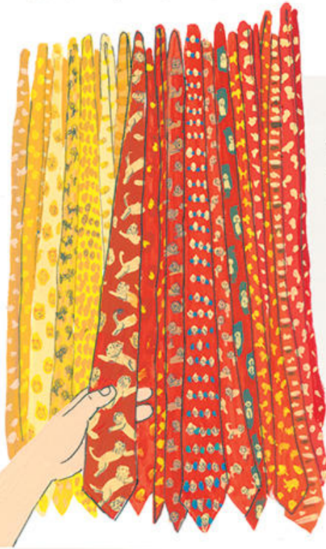
Lions embellish dozens of ties.