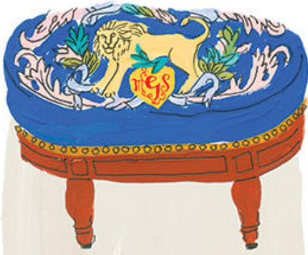
Lions are embroidered on footstools.

"Sandy stitched this one for us with our initials!"