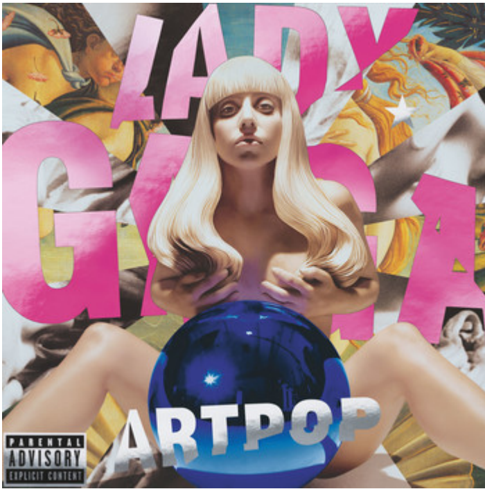
Cover art: Jeff Koons