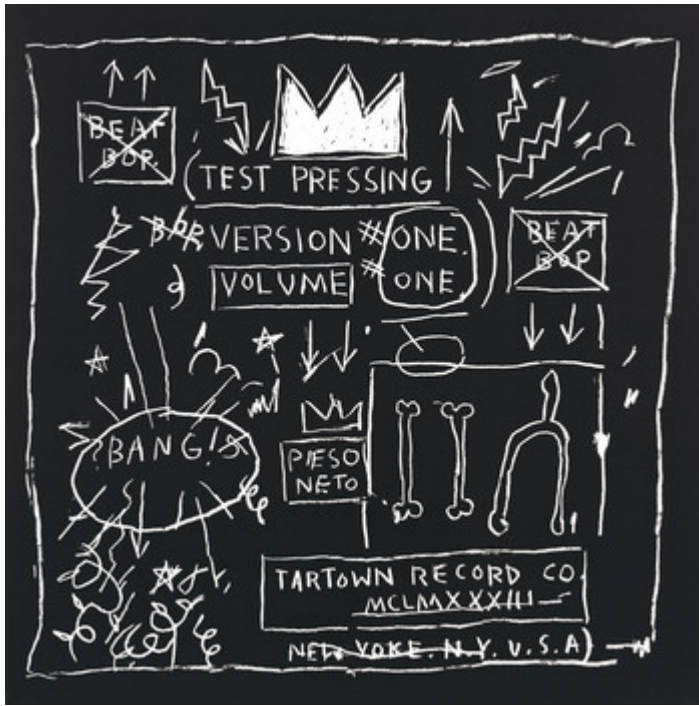
Cover art: Jean-Michel Basquiat