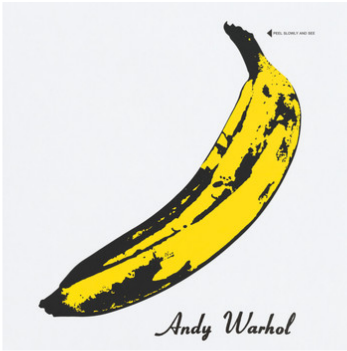
Cover art: Andy Warhol