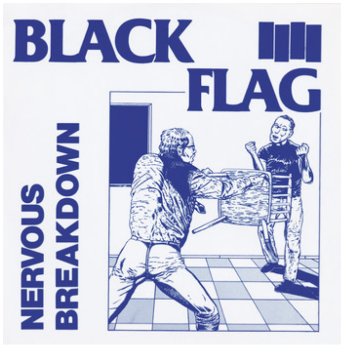
Cover art: Raymond Pettibon