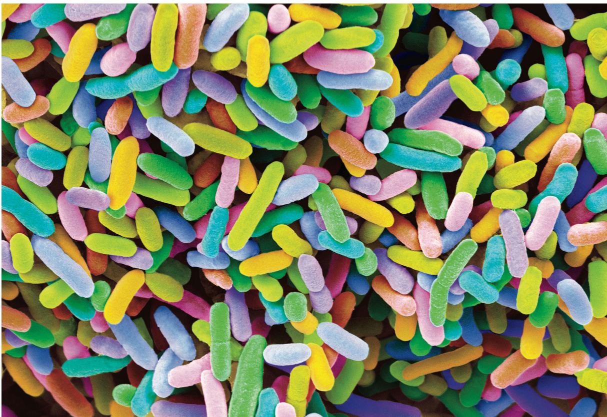
E. coli bacteria.

Through a few clever molecular hacks, researchers at Columbia University Irving Medical Center have converted a strain of bacteria into a microbial “tape recorder” that they say could be used to detect the presence of invasive microbes, or worrisome levels of familiar molecules, inside the human body.