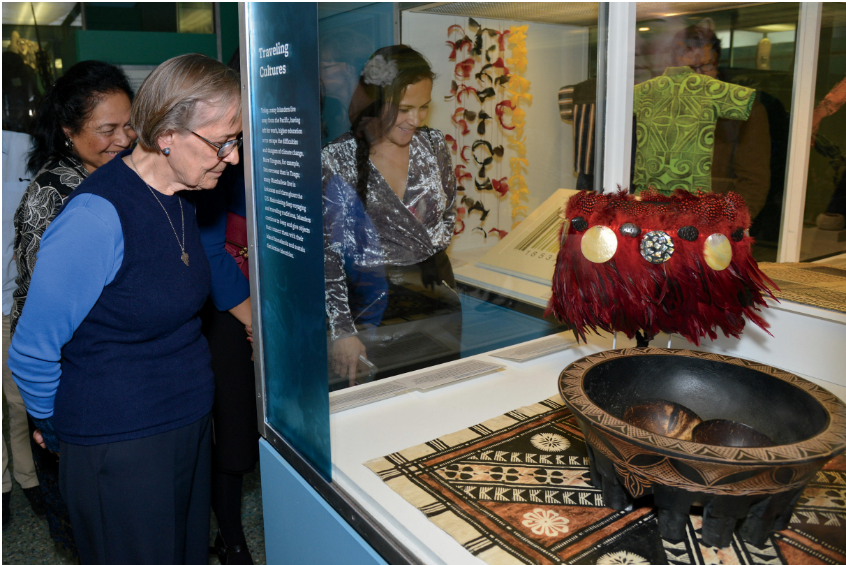
Artifacts of Pacific Islander culture at a student-organized exhibit.