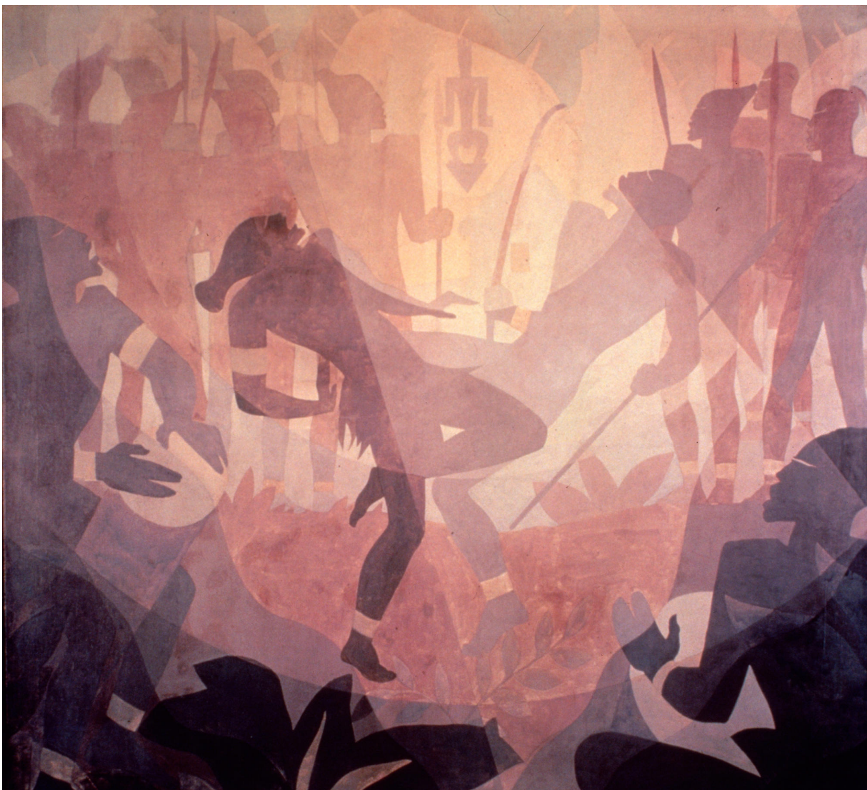
Aaron Douglas, "Aspects of Negro Life: The Negro in an African Setting," 1934.