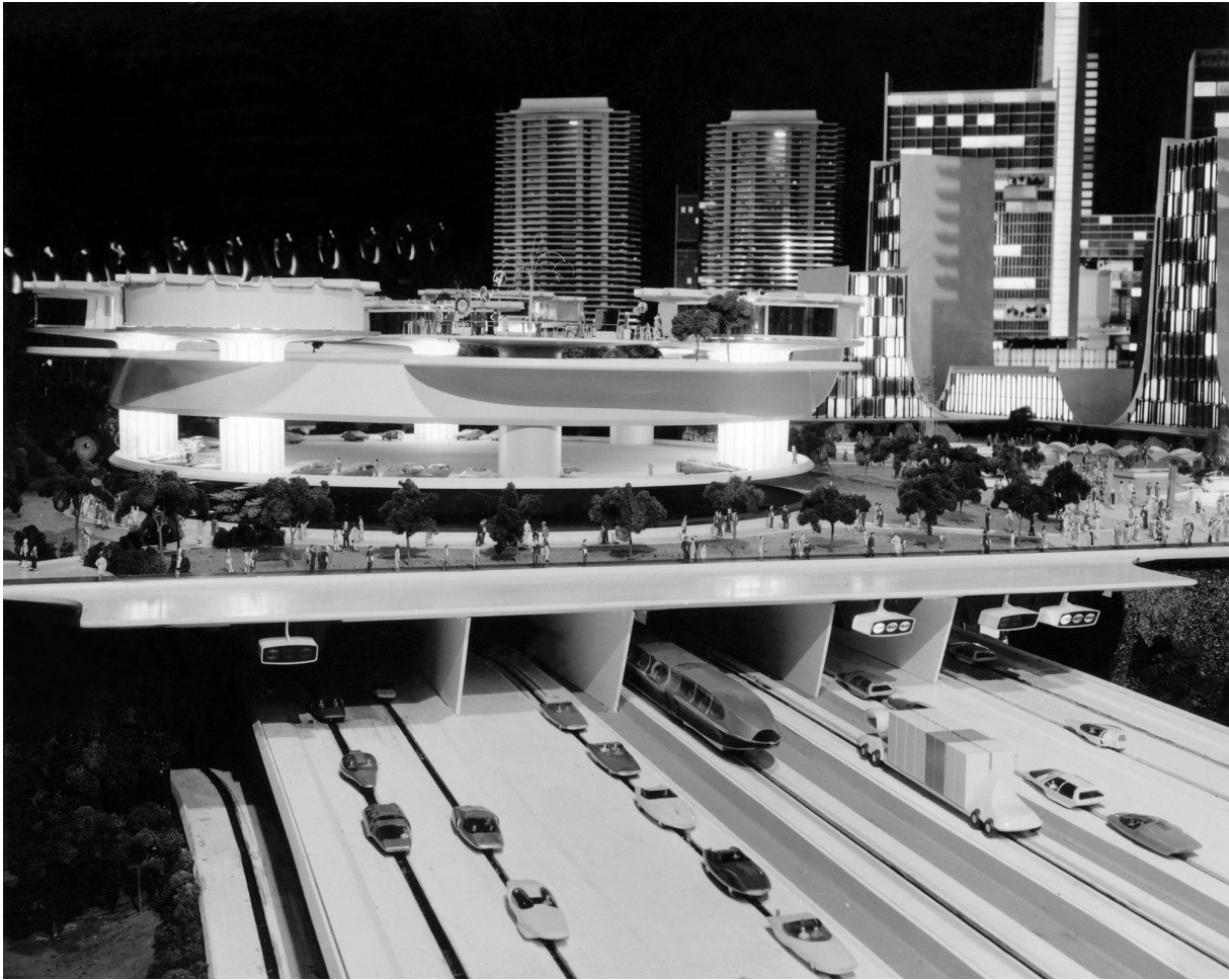
The GM exhibit at the 1939 World's Fair, Futurama, featured an automated highway system.