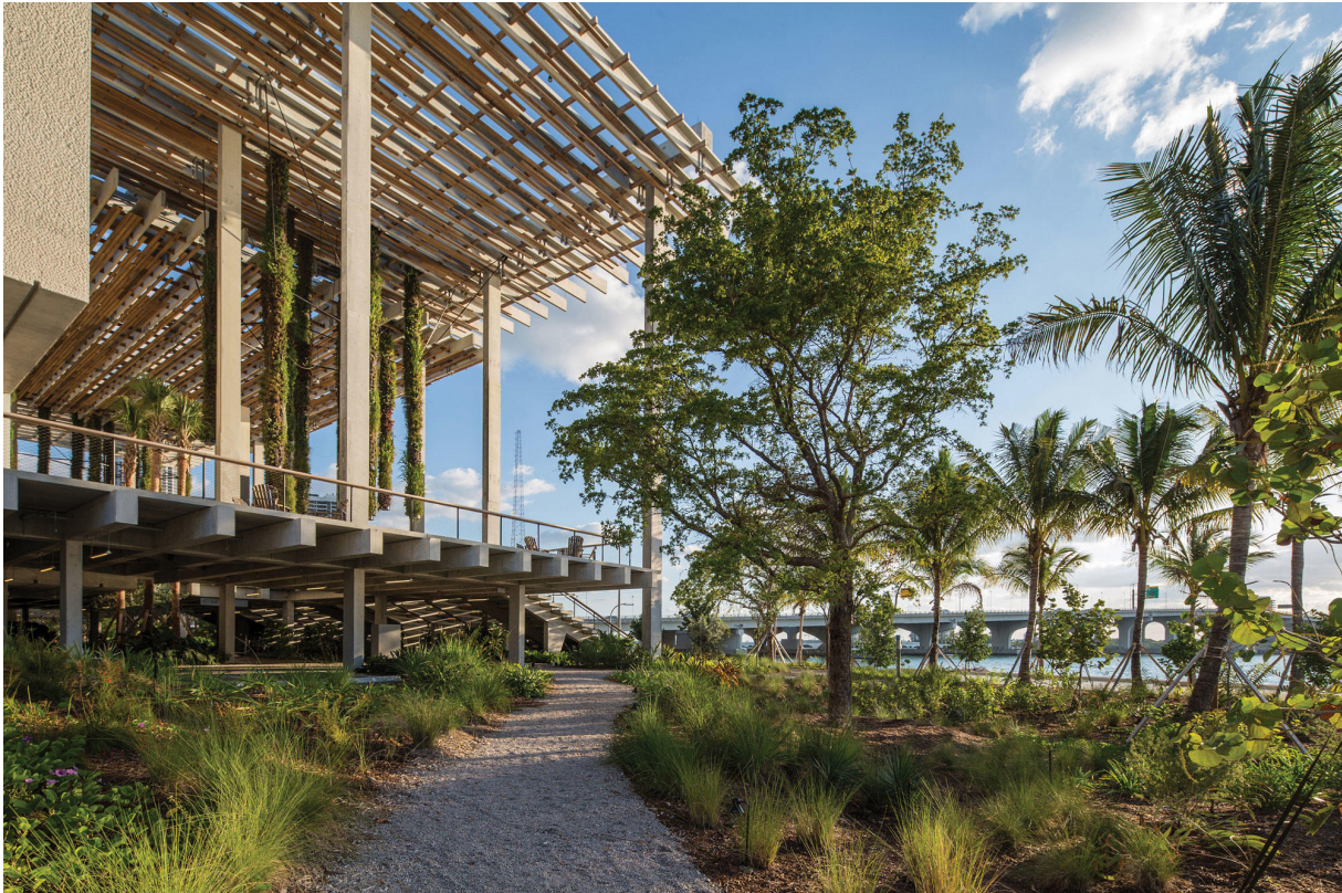
The grounds of Miami's Pérez Art Museum.