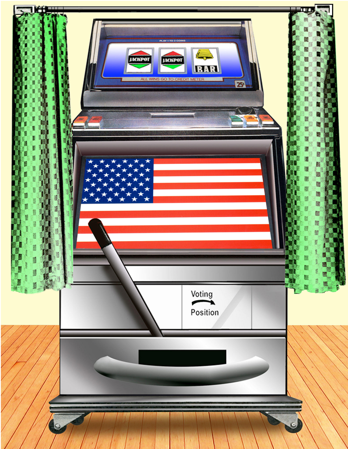
Cathy Hull / Thispot.com

If the election were held today, who would you vote for?" That's a question pollsters typically pose to generate the statistics that pundits ponder and citizens avidly