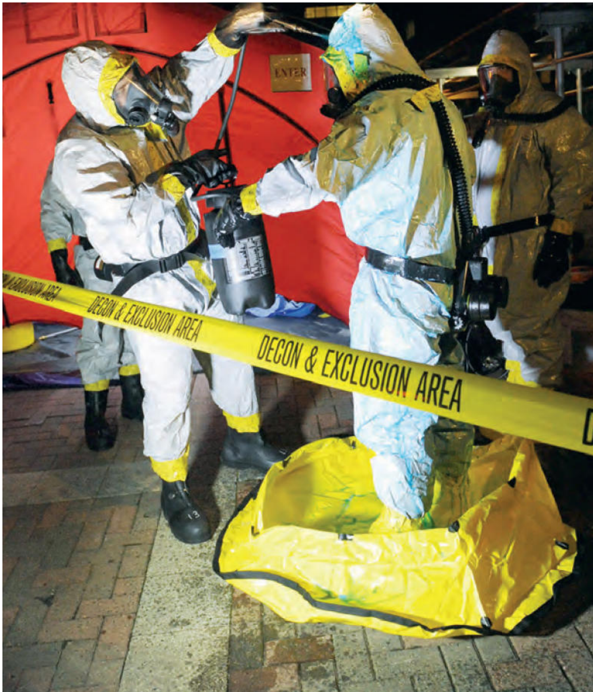
Members of the New York City Fire Department test a blue-colored bleach spray that Columbia engineering students created to help emergency workers cleanse hazmat suits of infectious agents.