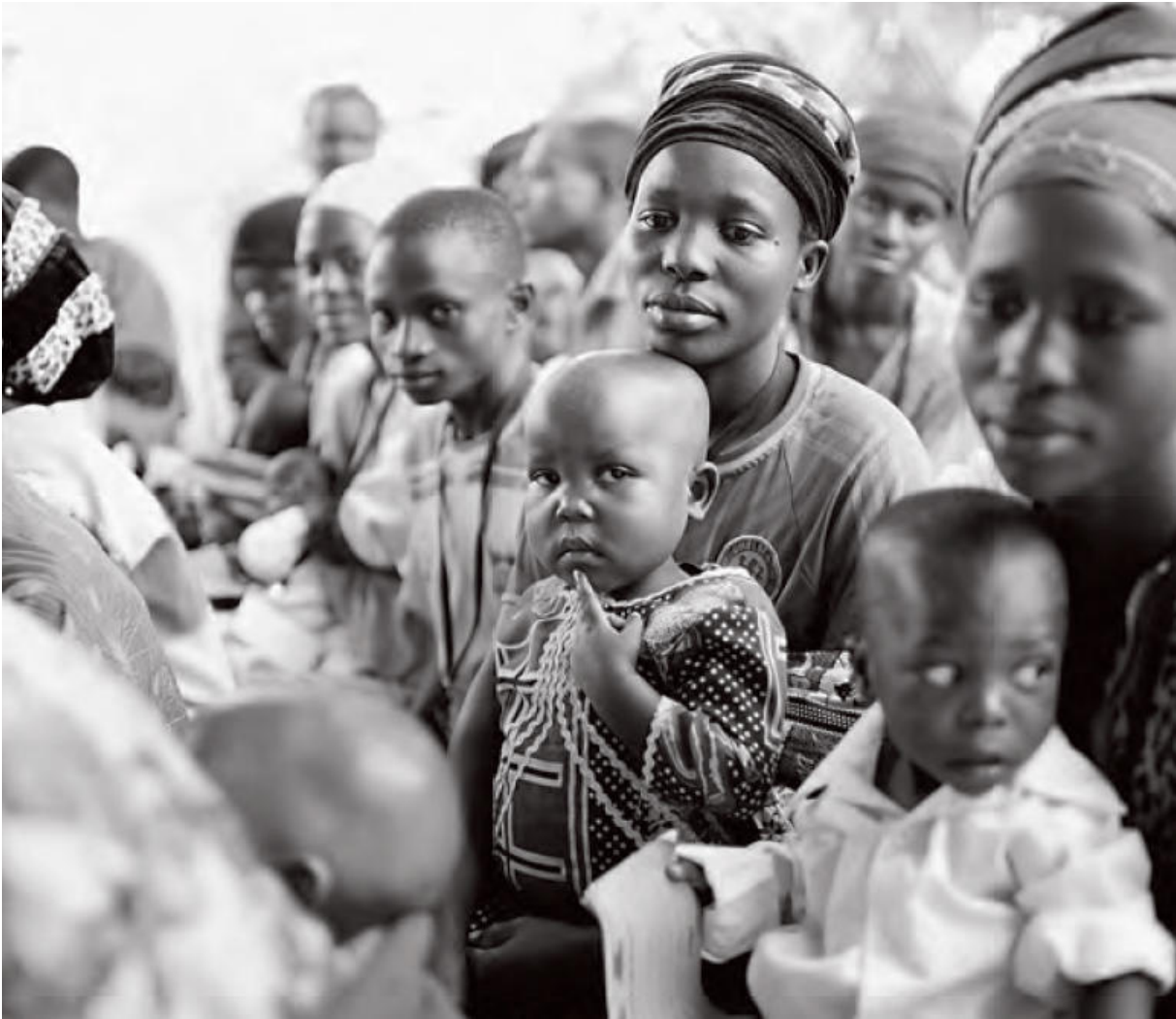
Families gather at Village Health Works' annual community forum in December.