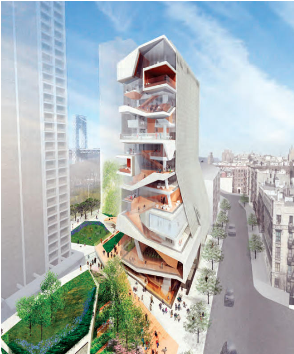
Columbia's new Medical and Graduate Education Building in Washington Heights, seen in this north-facing rendering, is scheduled to open in 2016.

Columbia's medical campus in Washington Heights is about to undergo a major transformation.