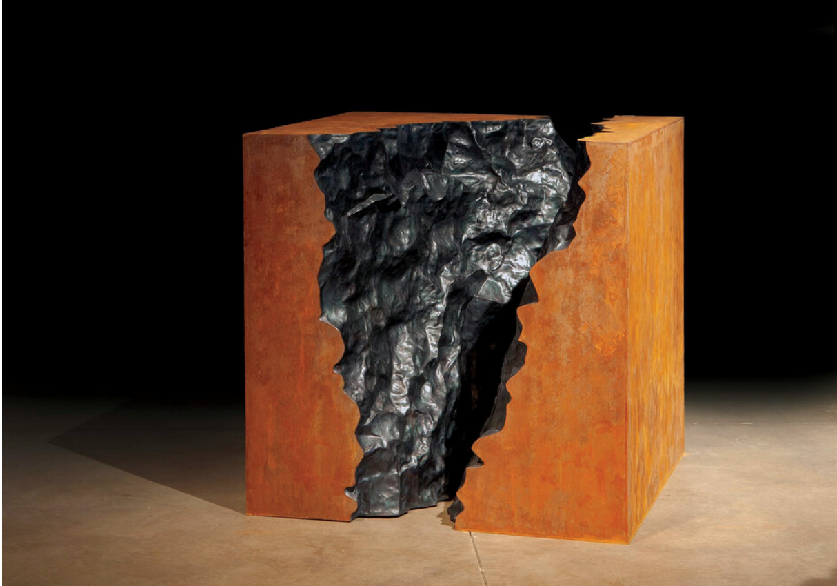
Fissure (2024) at the Jewish Museum of Venice. (Jonathan Prince Studio)

Liquid State , a series of stainless-steel installations reminiscent of teeth, and Flow State , which contrasts smooth and jagged surfaces. A steel sculpture from Flow State titled Fissure recently appeared at the Jewish Museum of Venice as part of The Contours of Otherness , an exhibition exploring migration and identity timed to coincide with the Venice Biennale. “The piece represents a fissure in the earth or a separation between the sides of oneself,” says Prince. “The idea is that beauty is in the imperfections and breaks, not the perfect surfaces.”