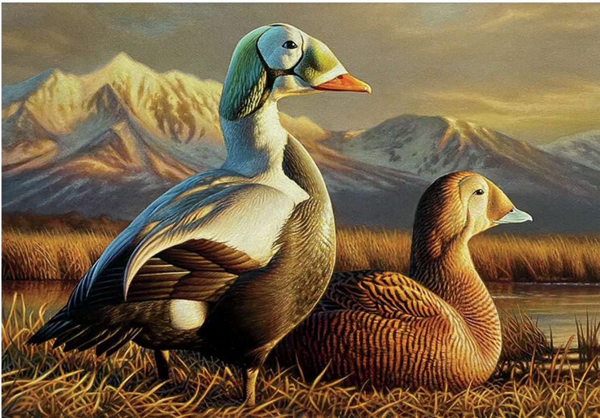
“Arctic Watch,” a portrait of spectacled eiders by Adam Grimm, placed first in the 2025 Federal Duck Stamp art contest. (Courtesy of Adam Grimm)