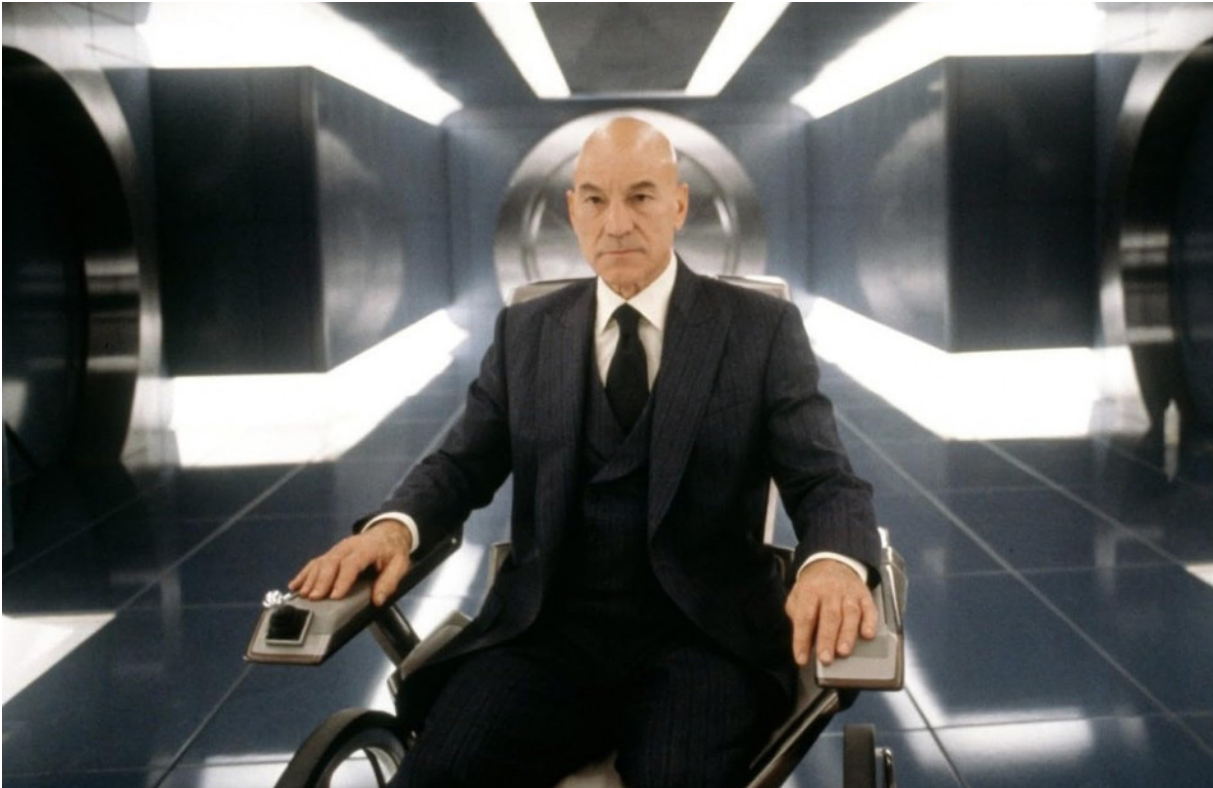
Patrick Stewart as Professor X in X-Men, 2000.