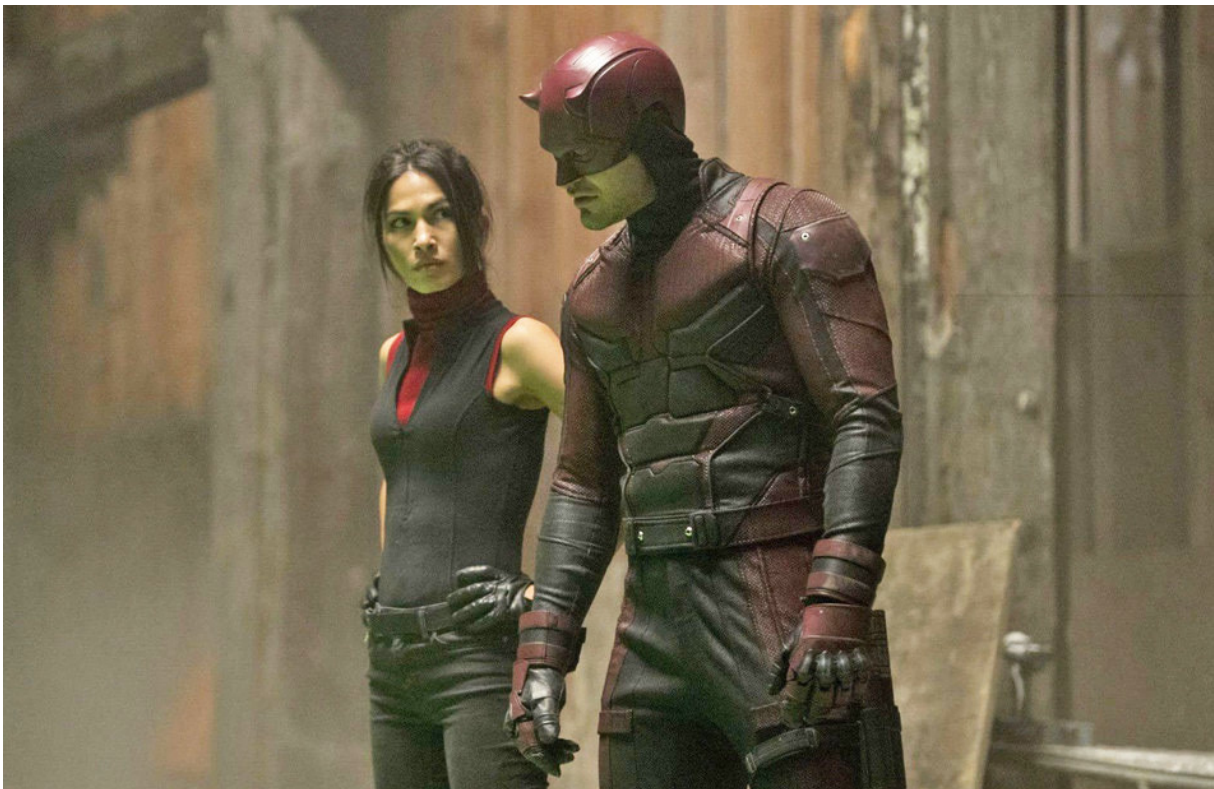
Elodie Yung and Charlie Cox as Elektra Natchios and Matt Murdock in the Netflix series Daredevil.