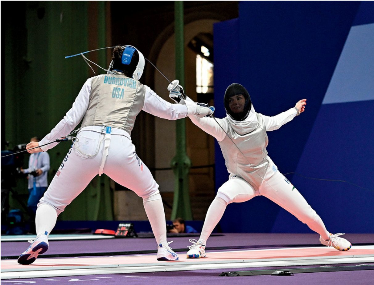
Jackie Dubrovich fences at the 2024 Olympics.