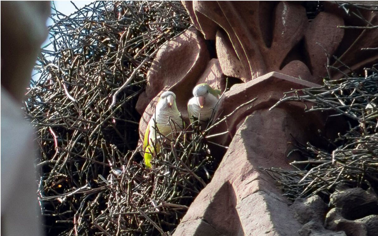
South American monk parakeets in Green-Wood Cemetery.