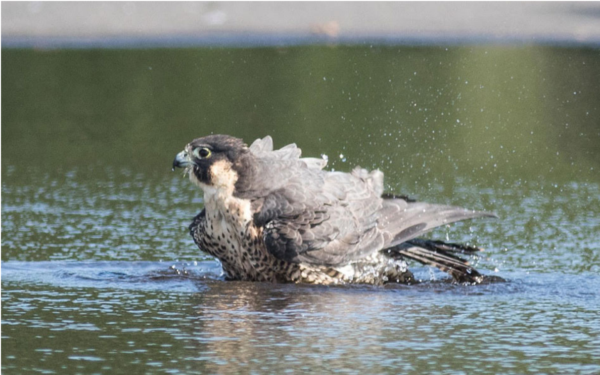
A peregrine falcon bathes in a puddle in the Orchard Beach parking lot.