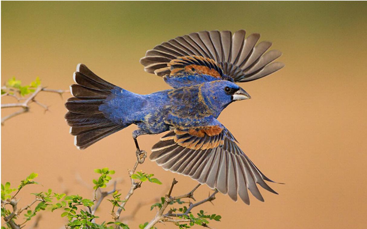
A blue grosbeak in Freshkills Park.