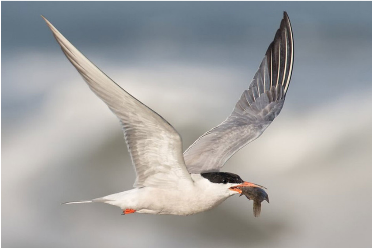
A common tern.