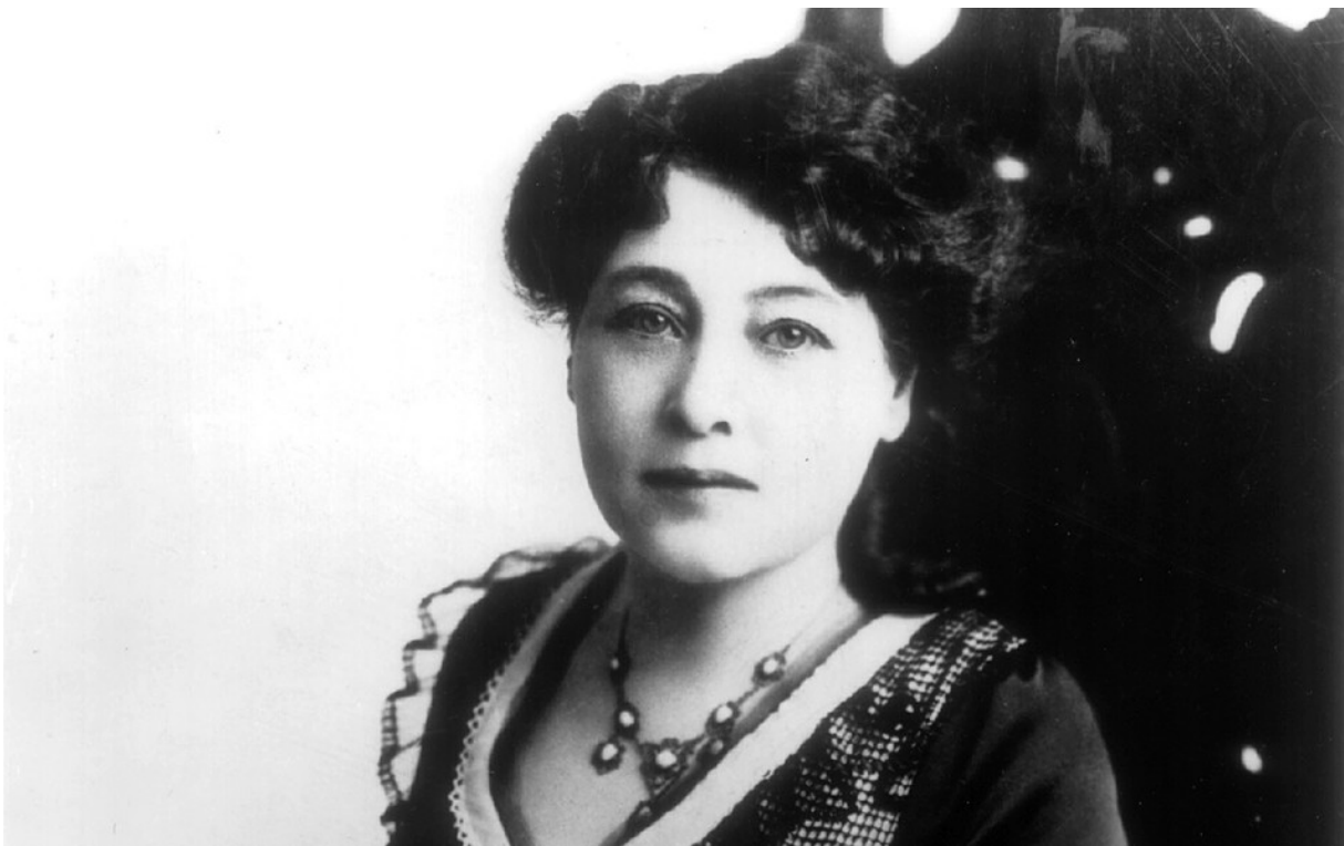
Alice Guy-Blaché

Mention women in silent film and most people will think of “America’s sweetheart” Mary Pickford or flapper flirt Clara Bow. But what many movie fans might not realize is that during the silent-film era in the United States, which spanned the late 1890s to the late 1920s, women weren’t just stars. They were also