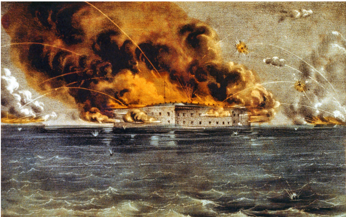
Bombardment of Fort Sumter, Charleston Harbor, April 12–13, 1861.

Exactly how did the American Civil War begin? This was the question Erik Larson was pondering when he began working on a new book in the first weeks of the COVID pandemic. After writing three histories of wartime Europe, most recently