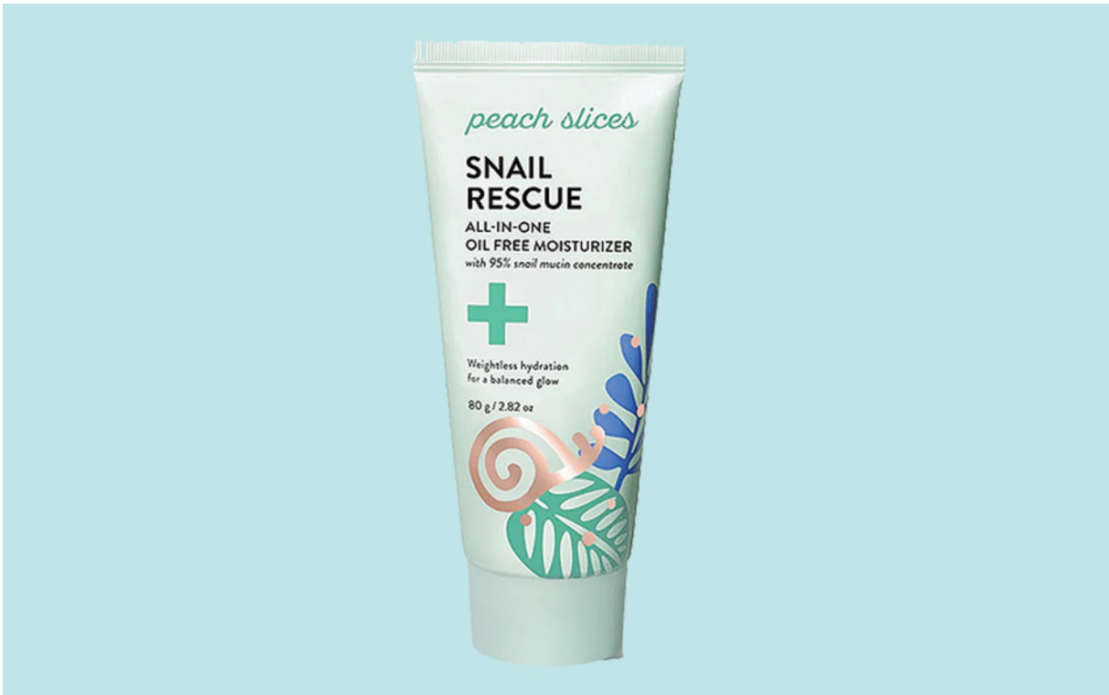
Peach & Lily