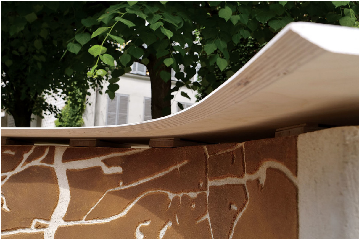
A raw-earth installation at the Reid Hall garden in Paris, created in collaboration with Lynette Widder.

For Ben-Alon, the ideal result of all this trial and error would be a catalog of standardized low-carbon products like prefabricated rammed-earth wall panels, natural-fiber insulation batts, and clay-rich finishes, all of them cheap, reliable, and abundant enough to replace today's fiberglass, metal façade assemblies, oil paint, and synthetic foam. At the current, artisanal stage, she and her team are feeding each amalgam into a 3D printer. "It should look more like cookie dough than pancake batter," Ben-Alon says. "As you push material through a nozzle, the fibers will align in a certain way, and once I know the direction of its structural integrity, I can create more complex geometries." The often frustrated hope is that these concoctions will yield elaborate tiles, weaves, vessels, and textiles.