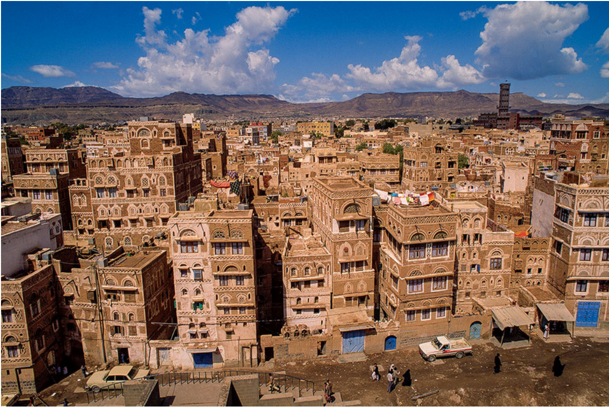
Rammed-earth buildings in Sana'a, Yemen.

That movement is spreading perhaps because it combines idealism with hard-headed pragmatism. Structures that are erected by hand using local knowledge and materials are designed for easy upkeep. Perhaps the most spectacular example is the Great Mosque of Djenné, in Mali, built in 1907. Every year, men, women, and children turn out by the thousands for a joyous festival to reslather its earthen parapets and turrets with a mixture of soil and water called banco. "I'm not saying that everyone should build houses out of mud and replaster every year, as they do in West Africa," Ben-Alon laughs. Rather, she believes that the wisdom of vernacular construction can be imported to Western cities. "In Europe, we're starting to see new three- and four-story multifamily structures made of mass timber, infilled with straw panels, and plastered with lime and clay. In Paris, there are three manufacturers of compressed-earth block."