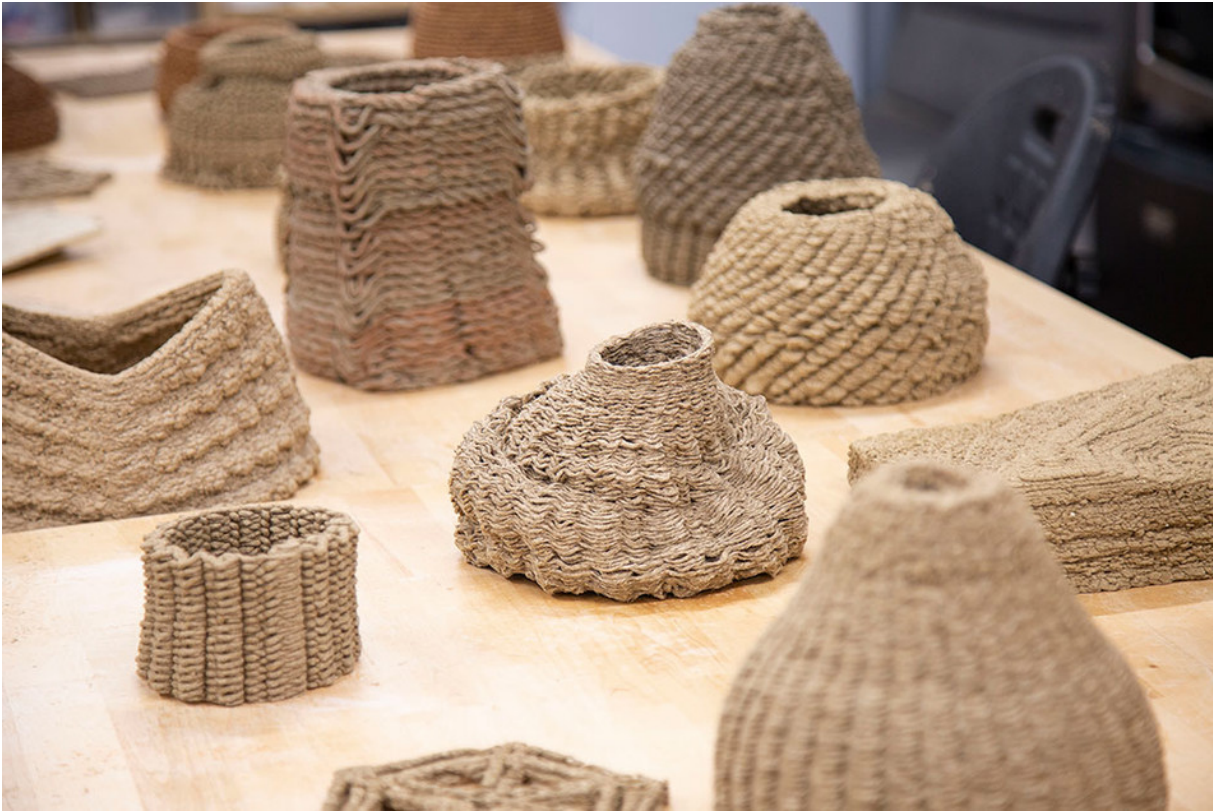
3D-printed earth weaves.

Cities have always been made from stuff that springs from the ground beneath our feet — granite, marble, wood, concrete, and glass. And until a few decades ago, the connection between source and building site was clear. “How this city marches northward!” the New York diarist George Templeton Strong 1838CC enthused in 1850. “Streets are springing up, whole strata of sandstone have transferred themselves from their ancient resting-places to look down on bustling thoroughfares for long years to come.” That image of the mountain coming to Manhattan embodied the optimistic nineteenth-century vision of nature as an infinite resource, the raw stuff of prosperity.