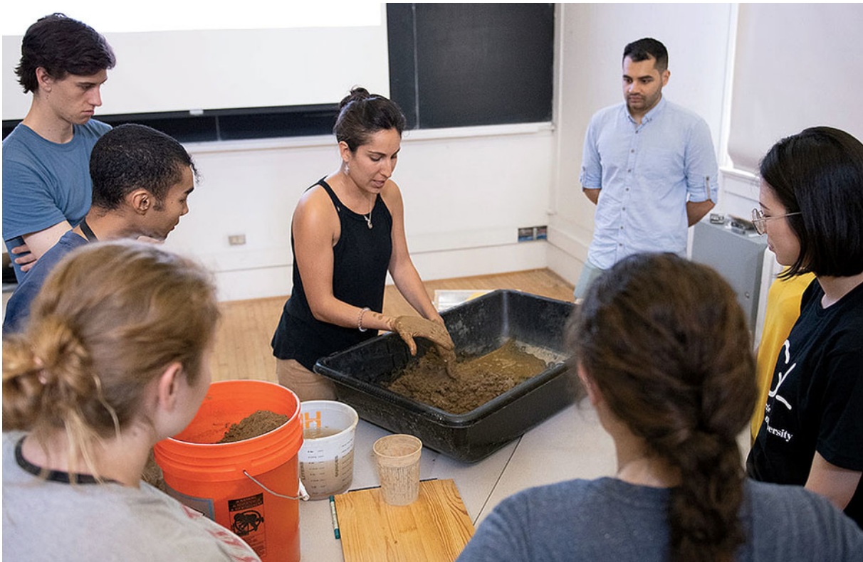
Creating soil blends in the lab.

That sensory approach is an essential part of the toolkit that Ben-Alon teaches her students, but it's only step one. Each day at the lab is part of a multi-phase movement that requires patience, rigor, and realism. It begins with stirring together experimental blends of sand, soil, clay, water, and fibers, then turns to analyzing how well different variables affect their plasticity, strength, and resilience. "We're swimming in a pool of endless possibilities," she says.