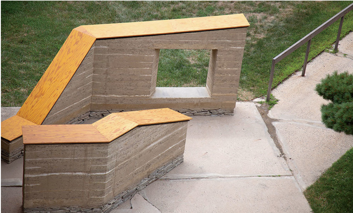
A rammed-earth wall at the Lamont-Doherty Earth Observatory, created in collaboration with Tommy Schaperkotter.

That series of hairpin turns in her trajectory has made her comfortable with the notion of trying something first and only afterward tallying up the reasons. “Ours is a doing practice ,” she says of the Natural Materials Lab. “My collaborators and I seek to understand the mineralogy of the material, then do a little microscopy to see the interaction. But mostly we try to work with something, and if it goes well, we try to figure out why.”