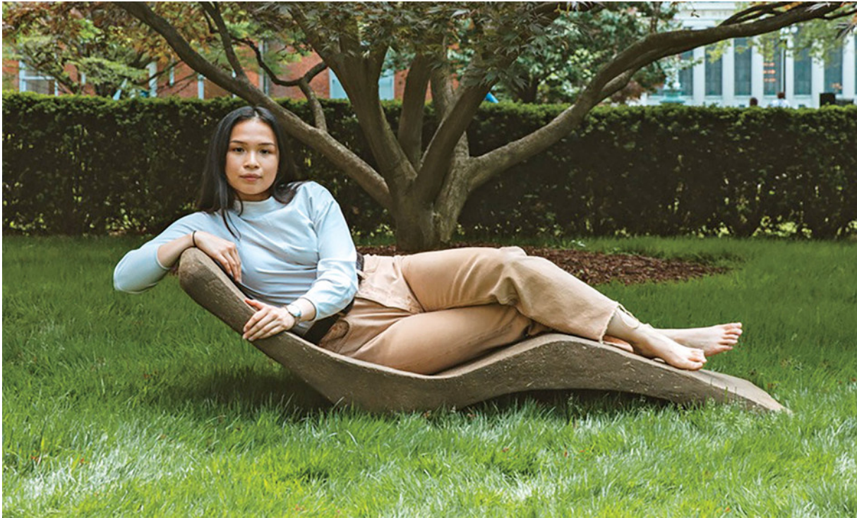
A biodegradable, low-carbon chair.

120 square feet. Now there's an approved construction method and safety standards, so it can be used much more broadly."