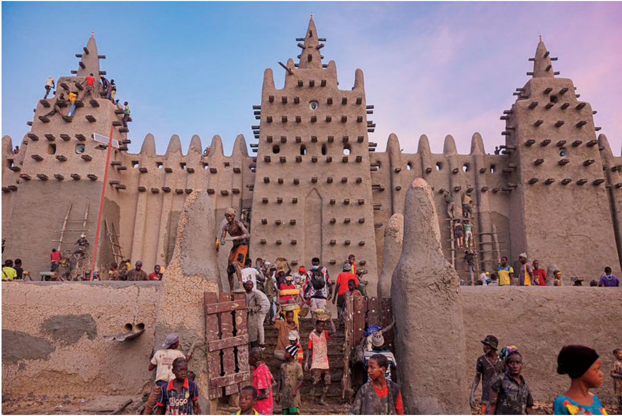
Replastering the Great Mosque of Djenné, in Mali.