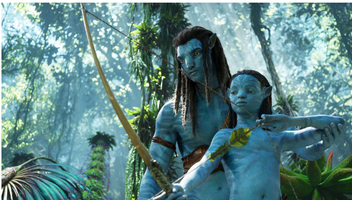
A scene from "Avatar: The Way of Water."