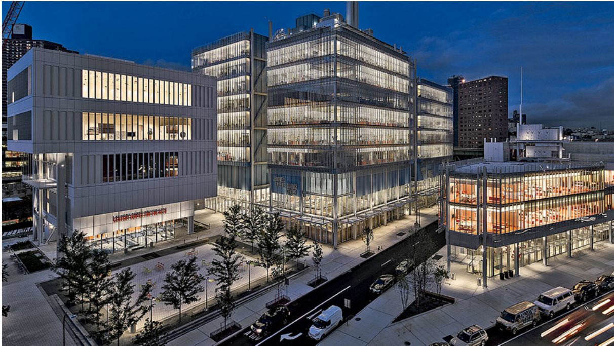
The Lenfest Center for the Arts, the Jerome L. Greene Science Center, and the Forum on the new Manhattanville campus.

problems affecting people's lives, including climate change and the COVID-19 pandemic.