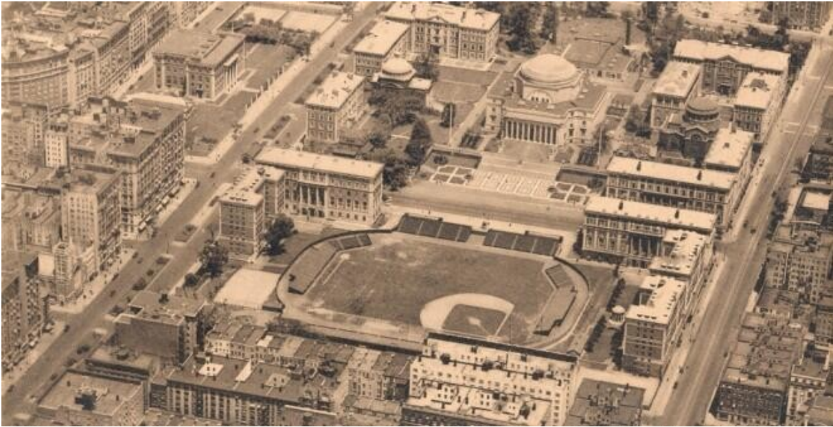
Columbia University campus circa 1920.

Now Kennedy took his lead off first, and Moore hurled the baseball toward home plate. Gehrig stepped forward and unleashed his mighty swing.