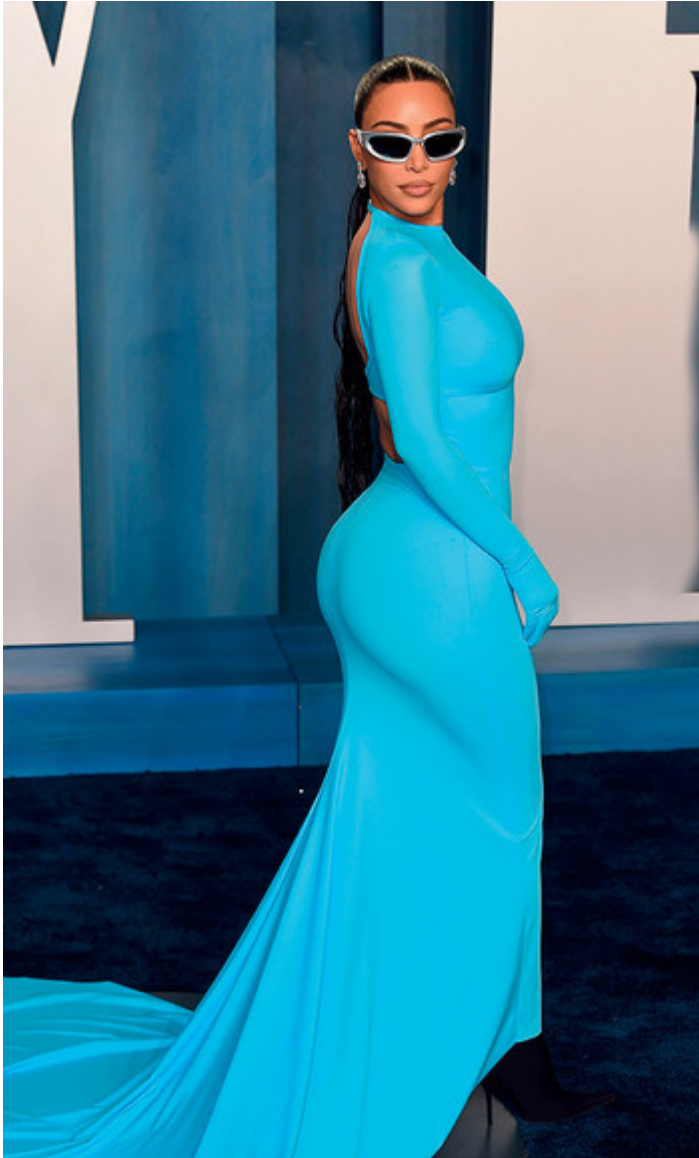
Kim Kardashian

nineteenth century used her autopsy report as evidence that Black people were less human than white people, and that Black women were more sexualized than white women. In both science and popular culture, Baartman was used as evidence to bolster racial stereotypes.