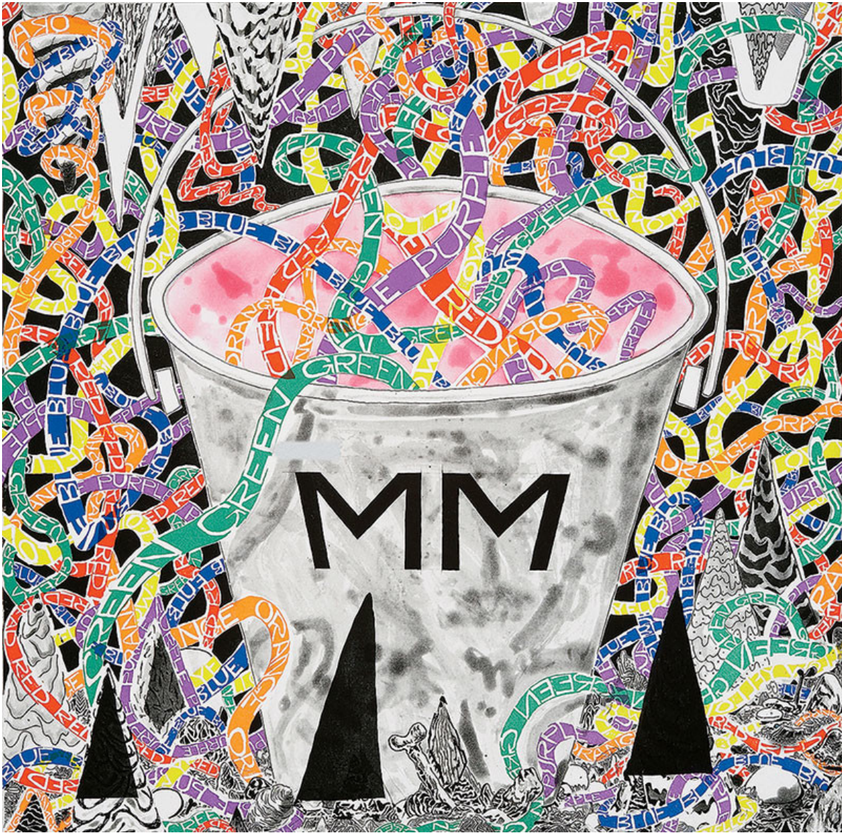
Trenton Doyle Hancock, "The Year: Voices of Rasp Ring Colors to Grasp," 2009.