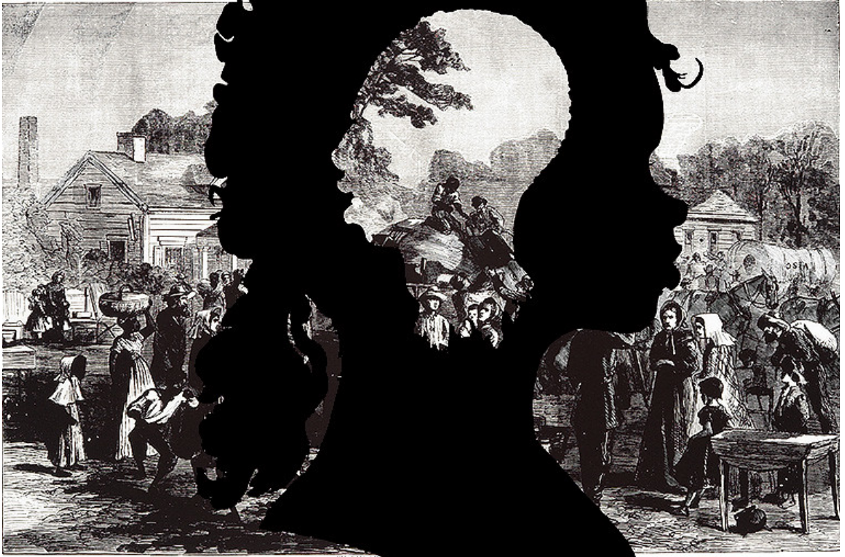
Kara Walker, "Harper's Pictorial History of the Civil War (Annotated): Exodus of Confederates from Atlanta," 2005.