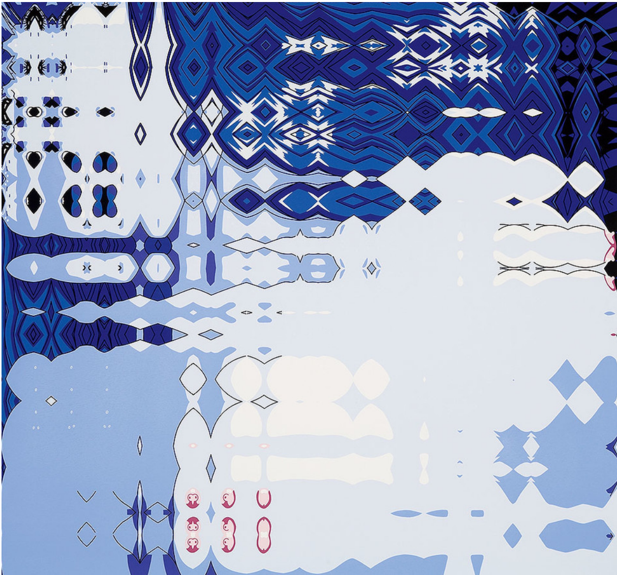
Carl Fudge, "Tattooed Blue," 2002.