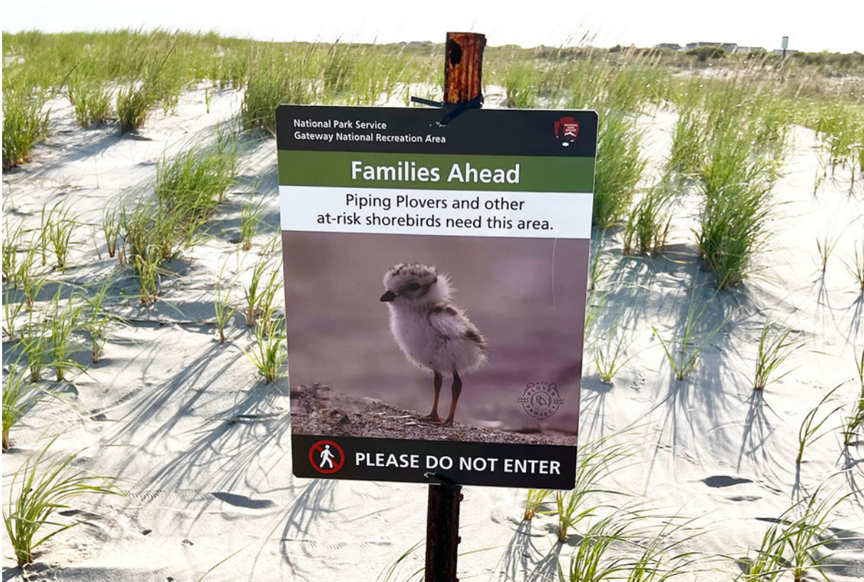
NYC Plover Project