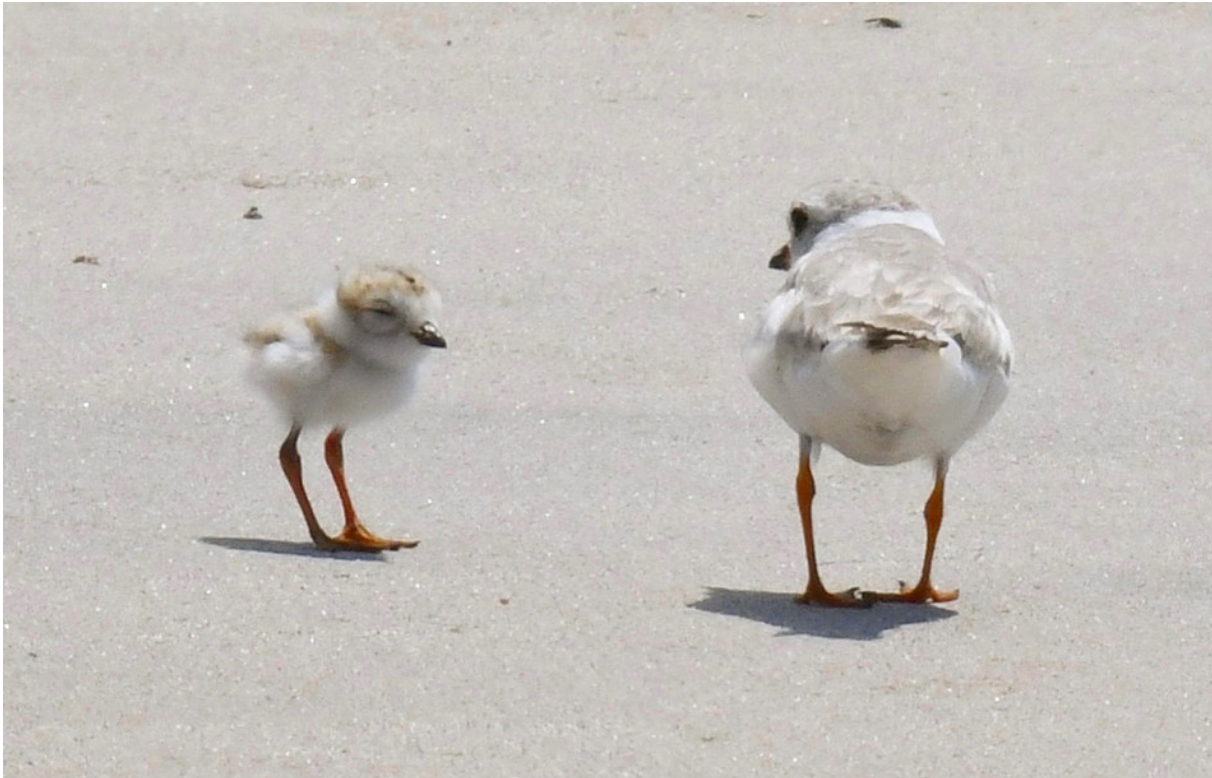
NYC Plover Project